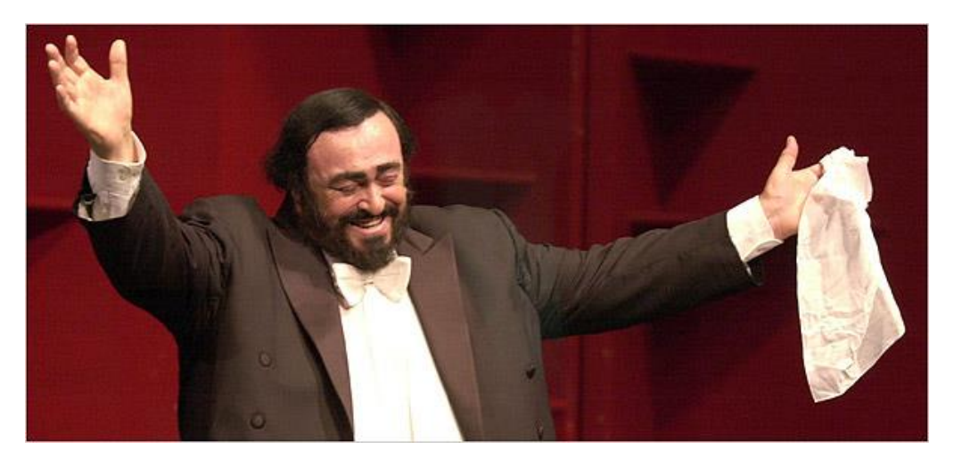
Luciano Pavarotti in 2002