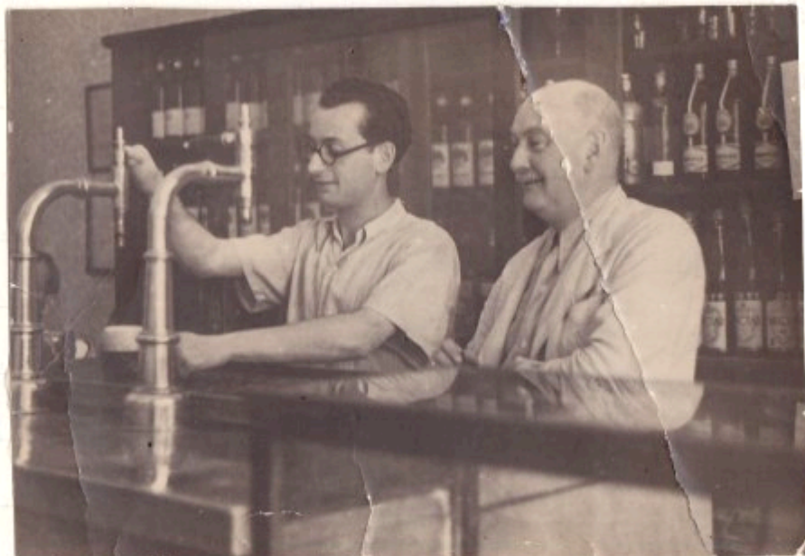
1945- With my father in our restaurant.