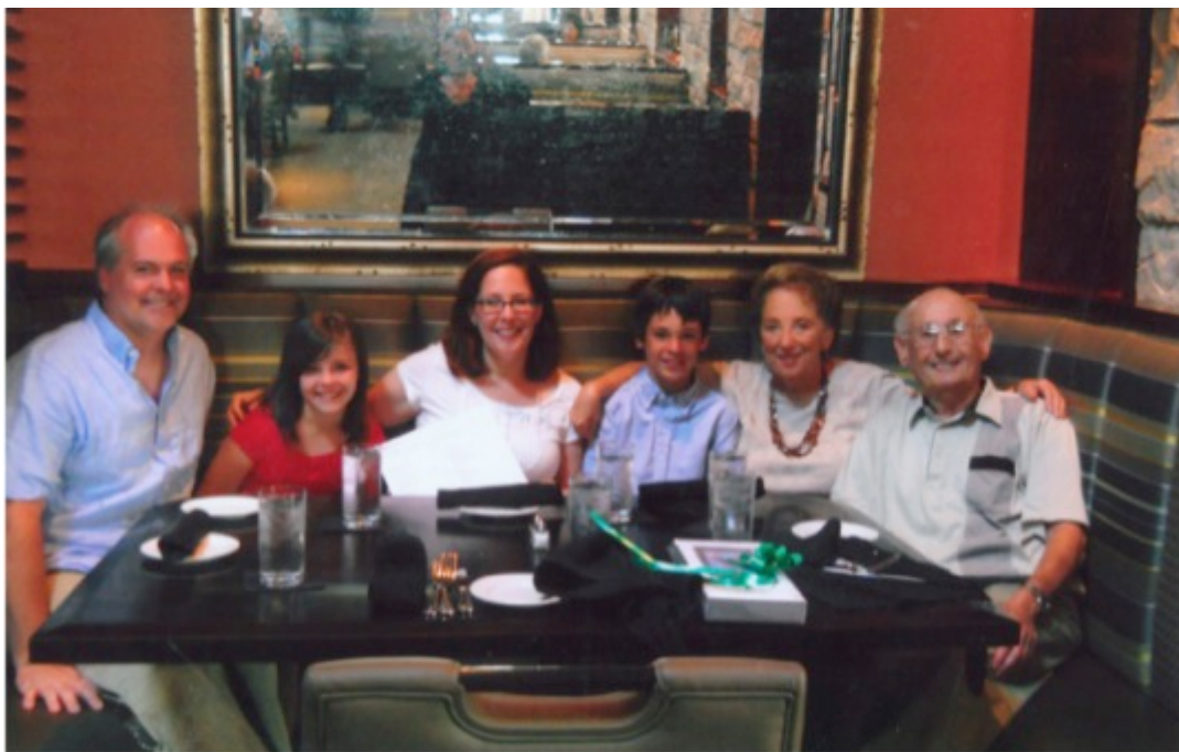
My 90th Birthday