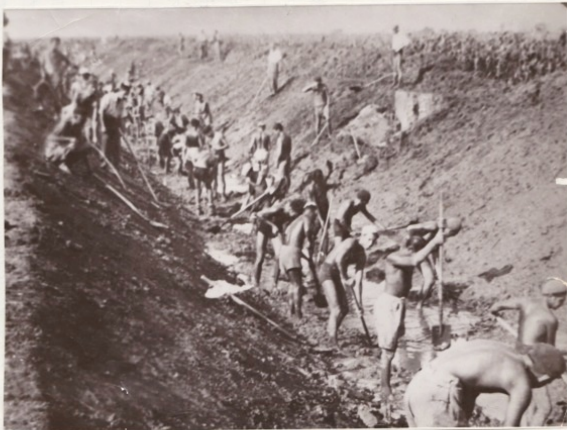
This picture was taken in secret, showing us digging barefoot in mud.

washing ourselves. We had to wash quickly, because in 30 minutes we had to stay in line for some black hot water called coffee and a piece of so-called bread. After that breakfast, we rapidly marched five miles to where we had to start digging a big canal that would both improve irrigation and serve as a stop against attacks by enemy tanks. We were assigned each day to dig in a certain area, barefoot in mud full of blood suckers and bamboo plants. The majority of the men couldn't finish the work in nine hours, so we were forced to stay under supervision until late in the evening. If by any chance somebody couldn't finish his job, he was punished by not getting food for the day. If somebody tried to escape, he was beaten with a double belt on his naked behind, sometimes 25 times. We had to watch all of this to learn from it. If the person yelled with pain, he got extra hits. The supervisors were very strict. Soldiers always carried guns and watched us all the time, even at night. We had to be careful not to complain or criticize the government.