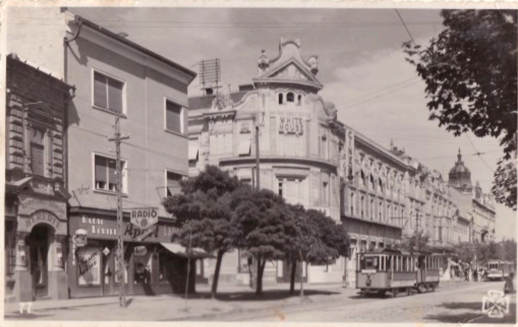
← The beer pub